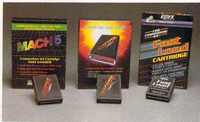
A sampling of the fast-load cartridges available for you to plug into your Commodore's expansion port.

The third solution to the speed problem is to actually replace the ROM chips in the computer and disk drive with improved versions thereof. Some of these ROM replacements produce near-